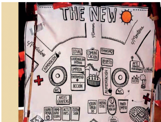
Figure 3. Sol-utopía

In this sense, the camp was organised like a parallel city (see Figure 3). The camp was permanently under construction with tarpaulins, megaphones, sound systems, chairs, beds, computers and solar panels. Many services that exist off-camp(us) were also replicated inside (a library and several archives, a day-care