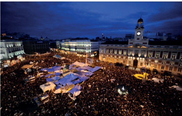
Figure 1. Under the tents (1)

It was precisely the Puerta del Sol encampment, which took place in Madrid in 2011, after the revolutionary movements often referred to as the ‘Arab Spring’ and before the Occupy Wall Street movement, that allowed us to understand these dynamics. In Sol Square, as in other encampments in different part of the world during this and the following years, signage and interactions are not only indicators of broader ideological and political processes, but a form of appropriating or reterritorialising core spaces in the city in order to build an agora (the general assembly), a meeting point, a place for discussion and decision making aimed at increased participation and intervention in the governance of the community. Thus, through linguistic practices, these urban spaces are built (see Figures 1 and 2).