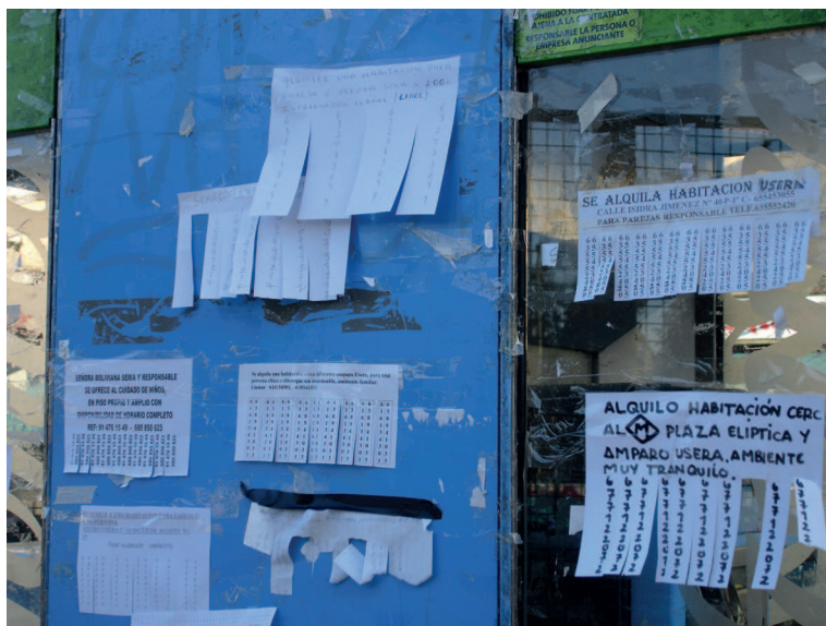
Figure 13a. Telephone call box used as a communication board in Amparo Usera.

In the images in Figures 13a, 13b and 14, the elements used for interpersonal communication unmistakably indicate the presence of several communities in the area, from China and Latin America. The telephone boxes are used as supports for notices in Spanish, addressed to residents of Latin American origin and who are seeking to share a flat or room with people from a similar origin, although no