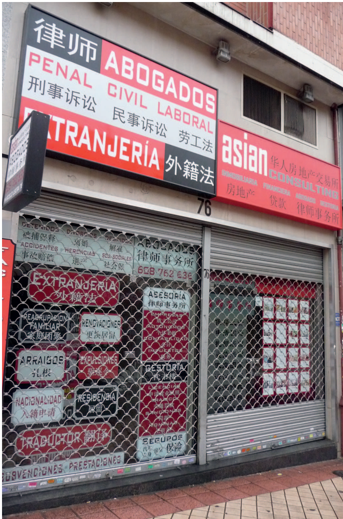
Figure 9. Legal firm in Marcelo Usera

(see Martín Rojo 2003), reflecting the incorporation of this community not only as customers but also as merchants.