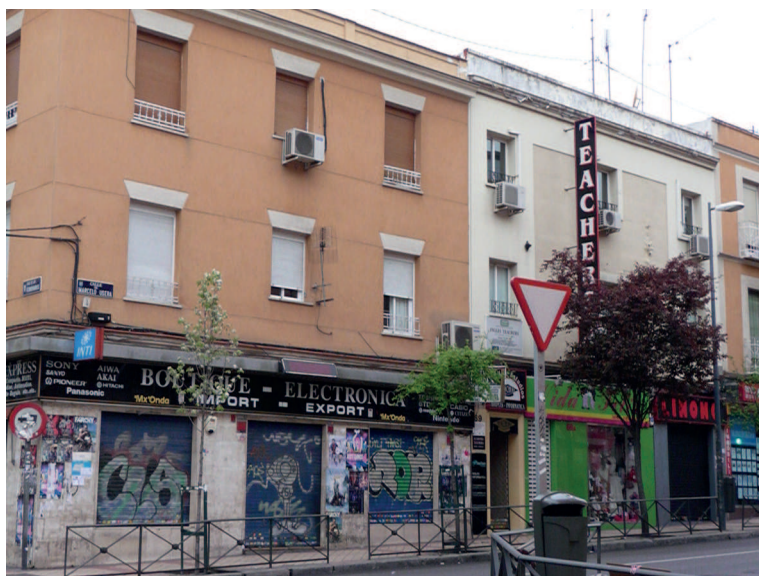
Figure 6. Marcelo Usera, near the crossroads with Nicolás Usera, from different viewpoints (see Figure 7)

In Marcelo Usera, the main street in the district, most of the establishments have a Spanish manager or owner. Figures 6 and 7 show the clear predominance of written standard Castilian here, spotted with signs including languages of prestige notably English and French ( teachers, boutique, import, export, express ). However, Modern Standard Chinese is also present in the form of simplified Chinese characters, and this provides a strong iconic value: on the one hand, showing that the establishment is dedicated to foreign affairs, although this message is subordinated to the Spanish text, in size, colour and/or typography; moreover, it is presented as