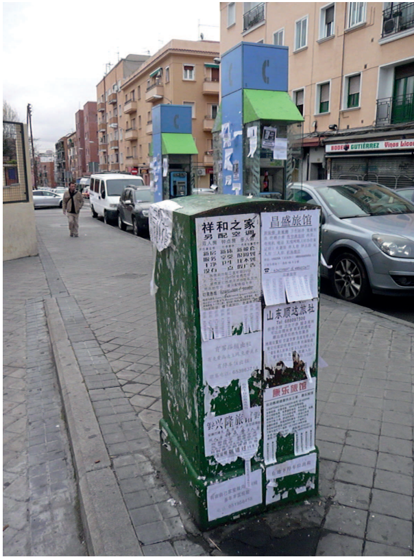
Figure 14. Mail box as communication board for Chinese speakers in Amparo Usera, with the telephone call boxes of Figure 13 behind.

ethnicing elements (flags or other national symbols, orthography) are present apart from a mention of the advertiser's nationality, and this could be interpreted as an effort to widen the scope of possible addressees. Near these signs, and beside Usera underground station, the Chinese community has covered the mail box with notices for the same purpose, although in this case, while surprisingly similar as regards information display and graphics, the notices are in Chinese simplified characters only.