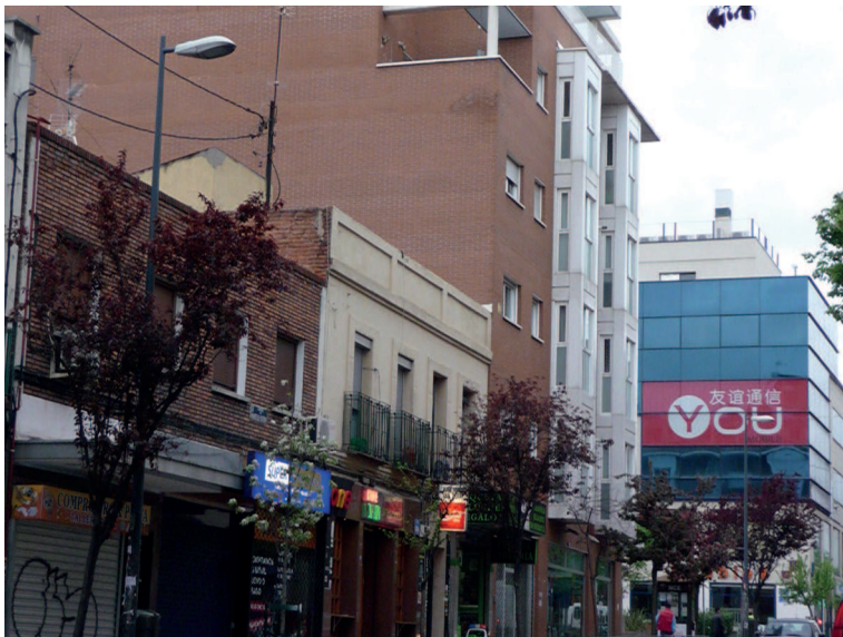
Figure 10. General view of Marcelo Usera

identity elements of these Latin American communities is very noticeable (Figures 11 and 12).