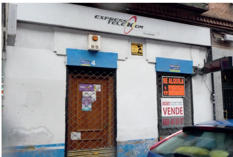
Figure 19. Former internet and phone centre, advertised by a real estate business specialising in the Chinese market

Although the area described is not large enough for us to generalise, the LL observed seems to reflect another parallel process to be researched further: the increasing presence of the Chinese community in contrast to a decreasing presence of business and signs associated with the diverse Latin American communities. Thus, Figure 19 shows a former internet and phone centre that we had observed