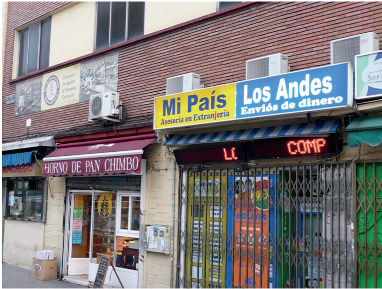
Figure 12. Establishments in Amparo Urua, beside the underground station