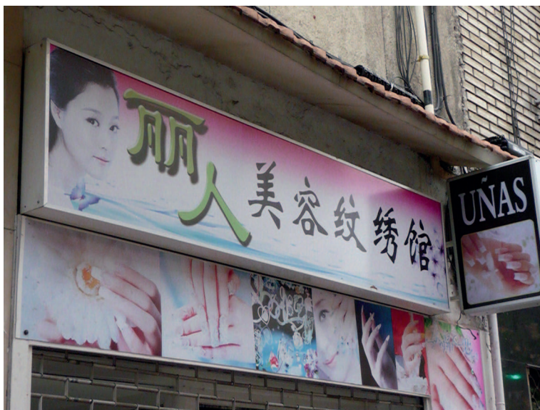
Figure 18. Establishment showing explicit Chinese aesthetics in Marcelo Usura

Although the area described is not large enough for us to generalise, the LL observed seems to reflect another parallel process to be researched further: the increasing presence of the Chinese community in contrast to a decreasing presence of business and signs associated with the diverse Latin American communities. Thus, Figure 19 shows a former internet and phone centre that we had observed