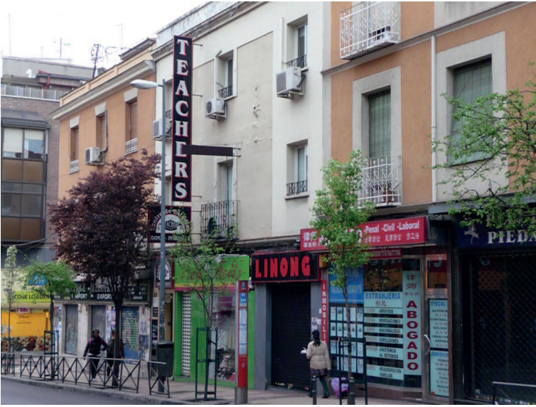
Figure 7. Marcelo Usera, near the crossroads with Nicolás Usera, from different view-points (see Figure 6).

pinyin , i.e., transliterated to the Latin alphabet ( Linong ). Closer observation reveals the subtle, almost imperceptible presence of the Quechua small blue sign ( Inti ) with a strong identity value on the left side of Figure 6, whose import seems to be limited to the members of a specific community, and remains generally unnoticed by the members of other groups.