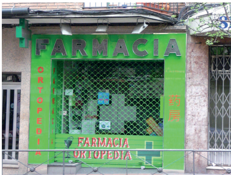
Figure 8. Chemist's in Marcelo Usera

on the opposite side of the street (see Figure 7). In this case, there is an interesting linguistic combination: even though the firm is a local one, the text elements in its signs are completely bilingual and reproduced in the same size. Finally, the English-language touch in the name, Asian Consulting , represents an added valued, and as in many cases of use of English in business in Madrid seems to be a touch of distinction (Bourdieu 1984), which suggests technical, commercial and entrepreneurial prestige.