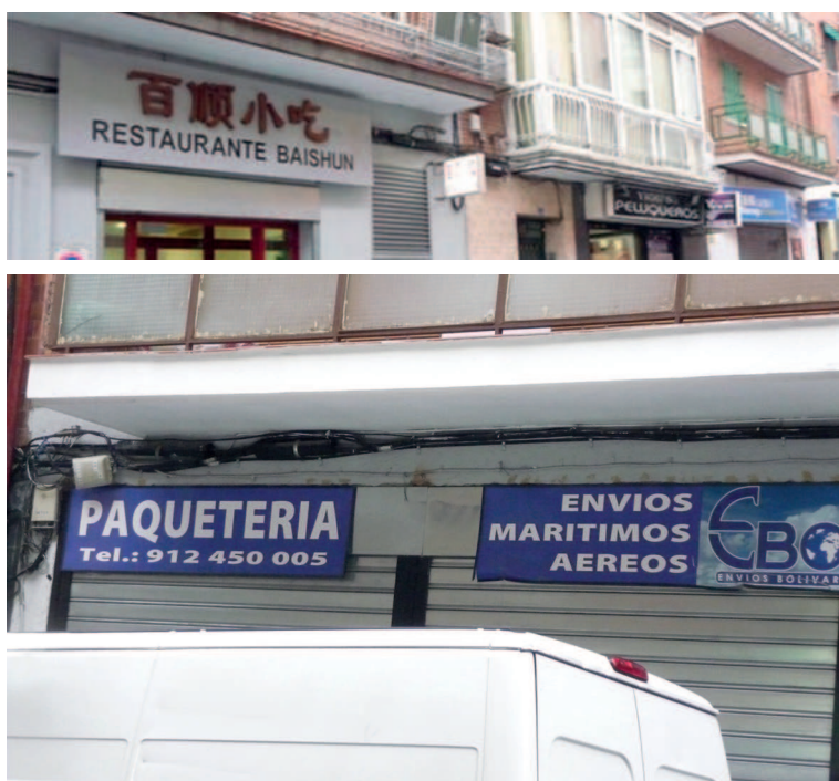
Figures 15 and 16. Signs in Chinese characters and Bolivian establishments with muted identity-marked elements

However, the fact that these streets are narrower, less important and less visible from the commercial standpoint fosters the progressive ethnicisation of some establishments and signs, as well as the growth of informal noticeboards for