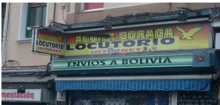
Figure 11. Internet and phone centre in Amparo Usera, opposite Usera underground station

The linguistic difference in this and similar signs is marked by differences in orthography, in particular, in Latin American signs the distinction between the voiceless interdental fricative sound /θ/ from the alveolar fricative sound /s/, which has acquired a cultural value representative of local speakers, is not marked and the letter “z” for de sound /θ/ does not appear. As is the case for the majority of Spanish speakers in the world, for migrants coming from Latin America, the phonological opposition between /s/ (a voiceless, alveolar, fricative) and /θ/ (a