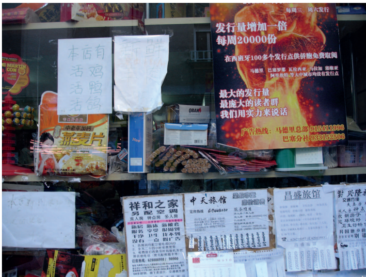
Figure 17. Business message addressed to Chinese inhabitants in Nicolás Usera

The establishment shown in Figure 18, again in Marcelo Usera, presents a written message (“uñas” means nails ) in Spanish, but the visibility of this language is minimal because of its location and colour, and the resulting effect can hardly be termed bilingual. The text in Spanish does not seem to be the business name ( nails ), and is rather a generic description of the type of activity, for those who might find the visual elements unclear. On the other hand, the dominant semiotic message is explicitly Chinese. At first glance, it seems clear who would constitute the type of legitimate consumer for this business. However, care should be taken before coming to conclusions regarding the actual audience, as passers-by could interpret this type of service as something exotic and new, which might in fact be attractive to local consumers. In any case, concerning the LL in Madrid, the degree of ethnicisation and the generation of symbolic values are very clear, and Modern Standard Chinese is again presented as a significant language in the domains of culture (calligraphy, etc.) and technology (telephones, computers, etc.).