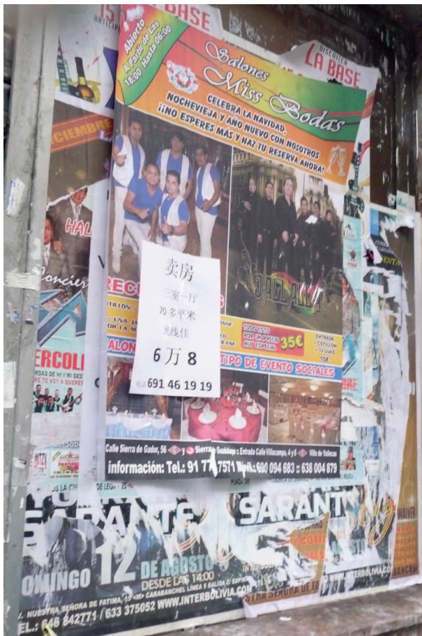
Figure 20. Advertisement for Bolivian fiesta, together with a private notice selling a flat for Chinese people

Chinese scripts show how this community is extending to occupy spaces tacitly “assigned” to the Spanish-speaking communities. Figure 20 shows an area of Nicolás Usera which is usually covered with posters announcing typical Latino events. The elements indexing social and ethnic identities in these cases are subtle and probably evidence the existence of an assimilation strategy with the host