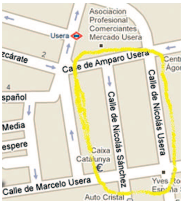
Figure 5. Plan of the study area

For some years, the market in Amparo Usera has been a traditional meeting point for people of Latin American origin (mainly Bolivian and Ecuadorian), resulting in the appearance of a large number of businesses owned by members of these communities. In contrast, Marcelo Usera is the main commercial thoroughfare in the area, specialising in traditional shops that are predominantly monolingual Castilian, although other languages are occasionally present. Additionally, the Chinese community is expanding significantly here and opening diverse new businesses and establishments. 4