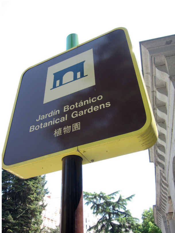
Figure 4. Tourist information sign in Madrid

to tourists, but to local populations of foreign origin, including migrant peoples, speaking different varieties of Spanish or different languages. Within the sphere of commercial activity, these signs are produced and directed at people who live and coexist in the area, and with them new spaces of exchange and conviviality are produced. Therefore, the languages and signs visible in the LL allow us to grasp how groups and individuals produce these spaces.