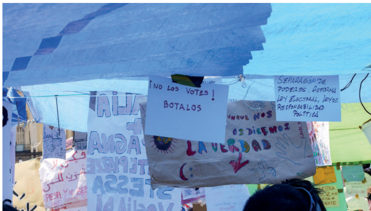
Figure 2. Under the tents (2)

We understand these spatial and communication practices as a form of “de-territorialisation”, by means of which protestors take the control and order away from a land or place (territory) that is already established. And, simultaneously, as reterritorialisation, by which protestors replace the traditional organisation and uses of the space with their own beliefs and rituals (see for both concepts, Deleuze & Guattari 1987).